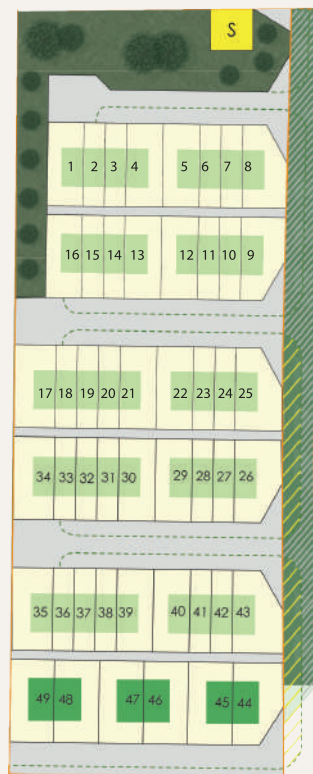
Lorong Seroja 3